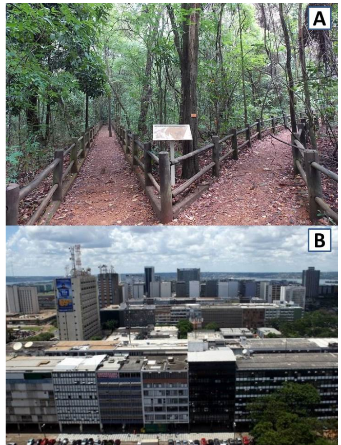
Figure 1. Experiment settings. (A) Capivara trailhead, Parque Nacional de Brasília (natural setting); (B) Setor Comercial Sul, Brasília (urban setting).

was on Capivara trailhead, a patch of gallery forest, the physiognomy that presents the highest structural complexity within the Cerrado physiognomies (Felfili 1995). The urban setting was at Setor Comercial Sul, the main city's commercial and financial centers (15°47'52"S, 47°53'18"W, 1115m a.s.l.; Figure 1B), with high building density and intense traffic of vehicles and people. These are two contrasting environments considering air, visual and sound pollution.